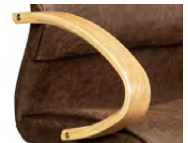
SLIMLINE OAK ARMS