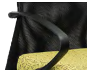
FLEXI NYLON ARMS