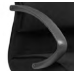
RIGID NYLON ARMS NON-FLEXIBLE