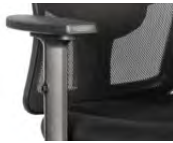
1D HEIGHT ADJUSTABLE ARM