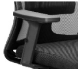
2D HEIGHT ADJUSTABLE ARM