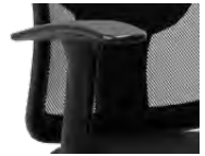
SKI ARM FIXED