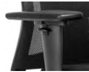
3D ADJUSTABLE ARM