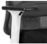
1D WHITE HEIGHT ADJUSTABLE ARM