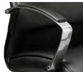
SOLID ALUMINIUM ARMS